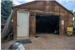
Maint. Bldg. Rplacement $100,000