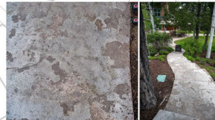
Pool Decking Replacement $452,500