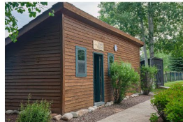
Tennis Shop Refurbish $25,000