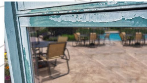
Windows Replacement $150,000 (Partial)