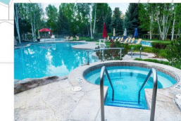
Spa Resurface $50,000